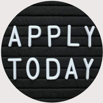
Vacant Director of Marketing and Communications